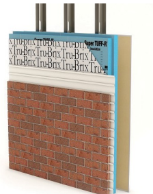
Metal Stud Wall