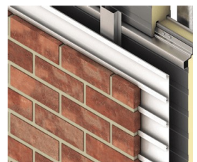
Insulated Metal Panel (IMP)