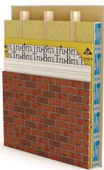
2x4 Stud Wall