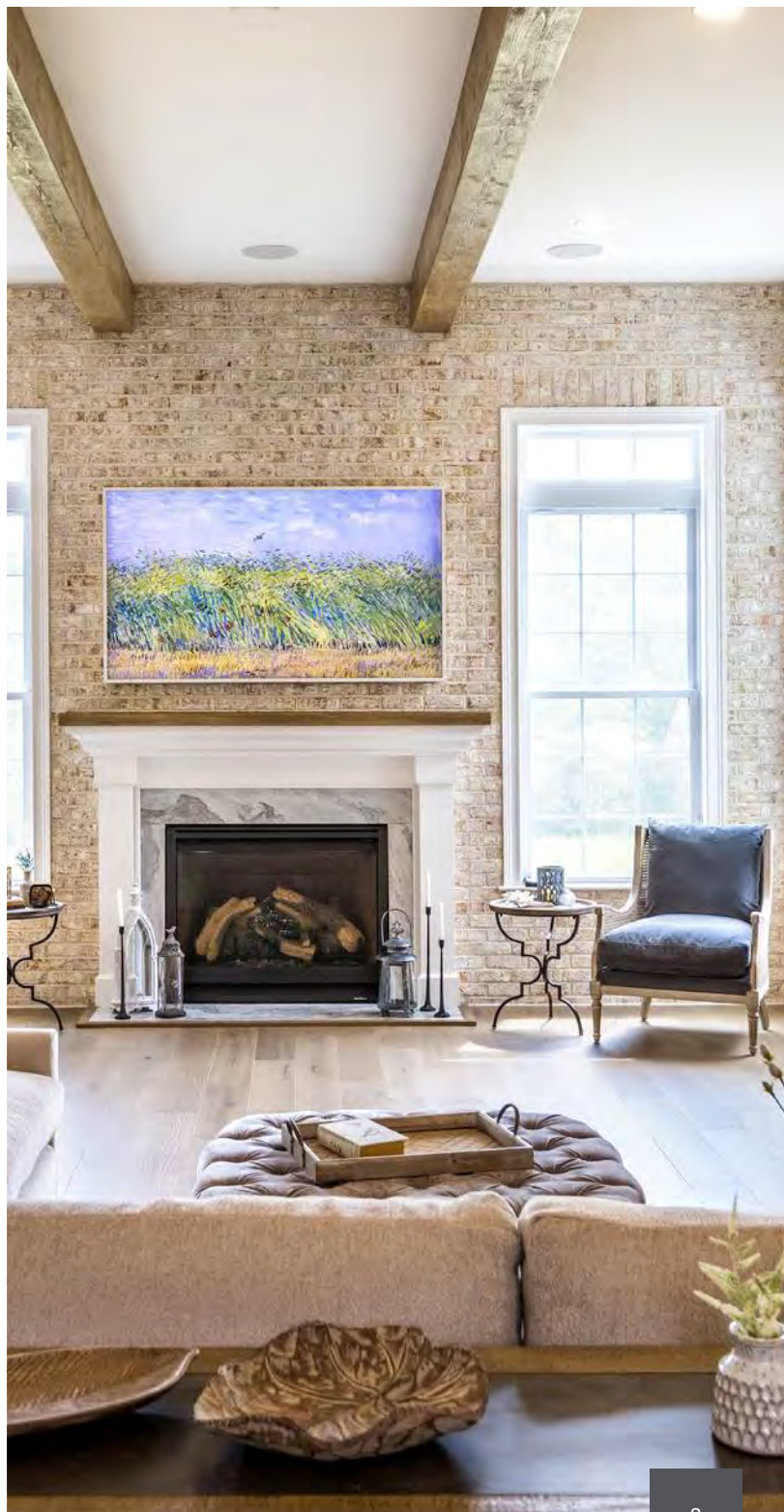
Sweet Pastels | Bayhill Thin Brick