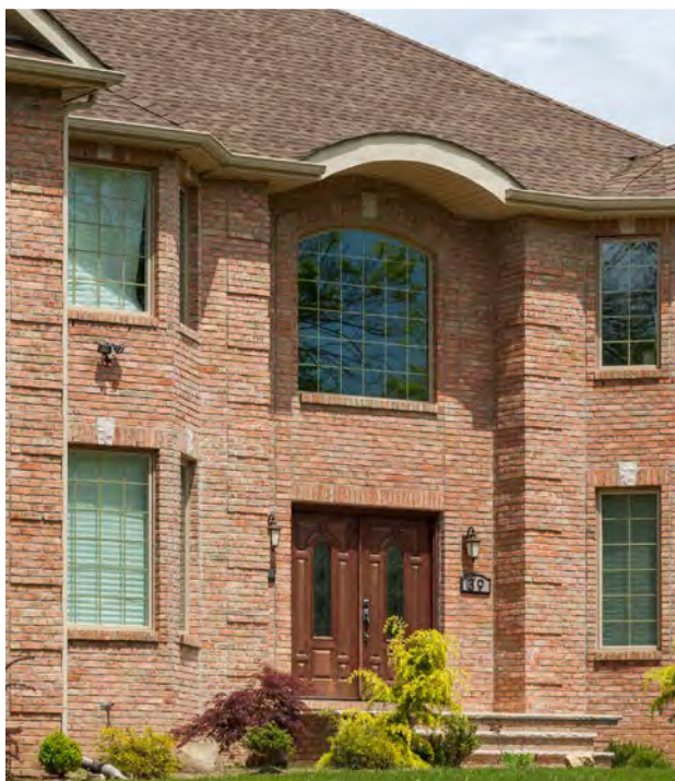
Pink & Blush Shades | Danish