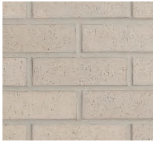
Revere Pewter Velour