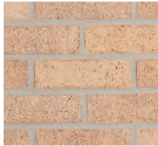
Desert Blend Velour

Not to be outdone, pastels will be making an entrance into home design trends of 2023 while homeowners embrace their boldness and try these sweet shades. Whether in furniture or in decor and accessories around the home, colors such as soft pink, mint green, and light purple are appearing to bring a subtle pop to a room's surroundings. This foray into pastels is evidenced by Pantone's choice for Color of the Year, Digital Lavender, featuring a light, soft purple.