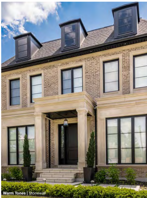
Warm Tones | Stonewall

2023 promises to be a year of earth tones and warm neutrals with pops of pink and blush colors. This year may also bring a surprise resurgence of pastel colors in elements like furniture and design accents.