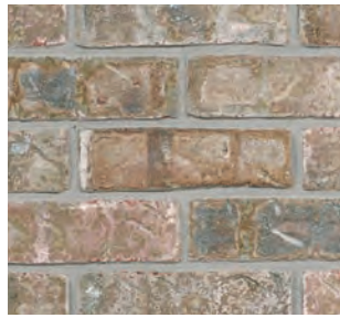
Nob Hill Thin Brick

The kind of earth tones expected to trend in the upcoming year include warm and natural shades such as terracotta, green, yellow, or plum. What makes these particular colors especially desirable is their versatility to blend seamlessly with nearly any architectural style or home.