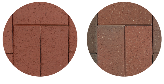
Dark Red Smooth Pull Range 4x8, 8x8 Chamfered 4x8 Chamfered