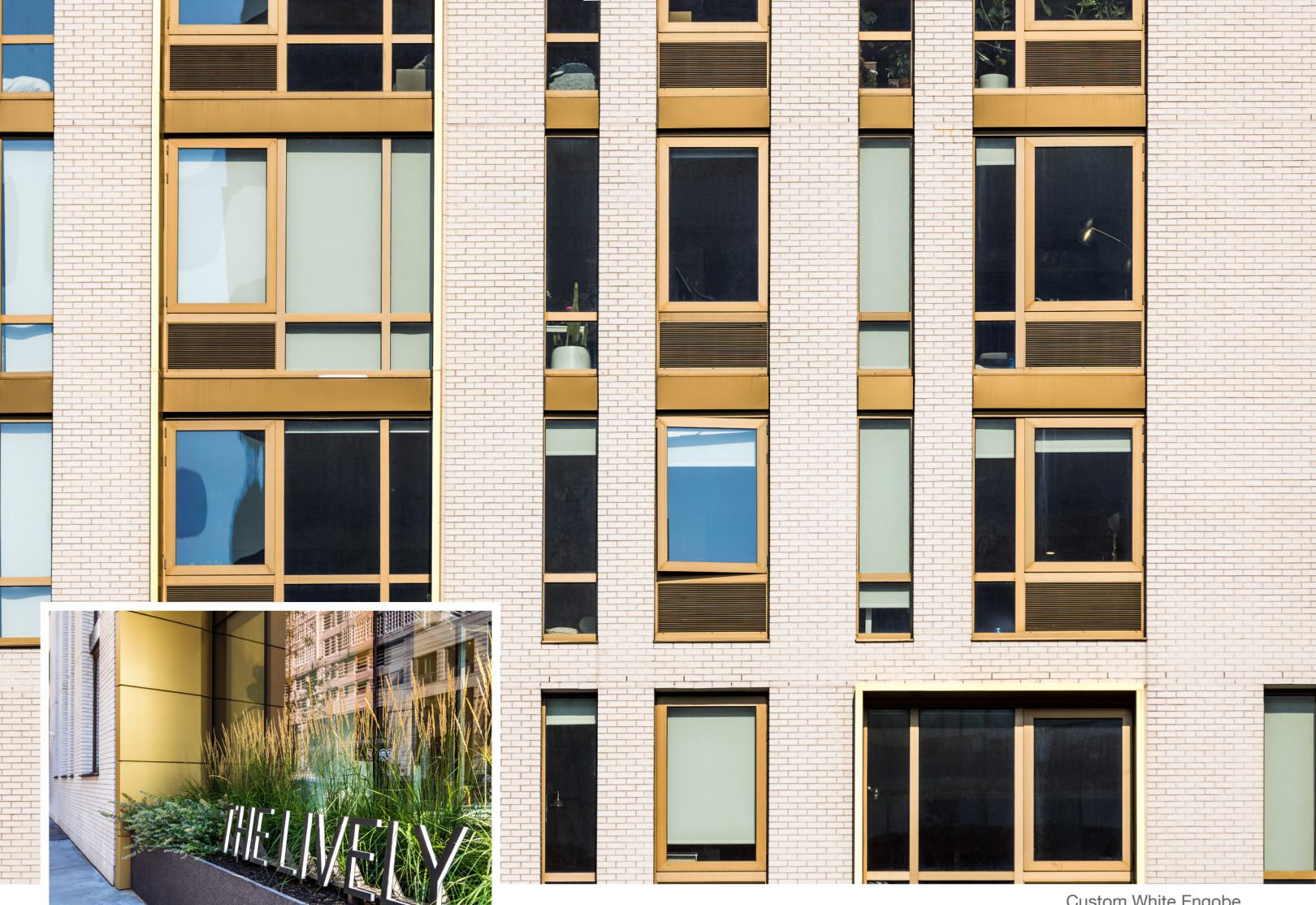
Custom White Engobe