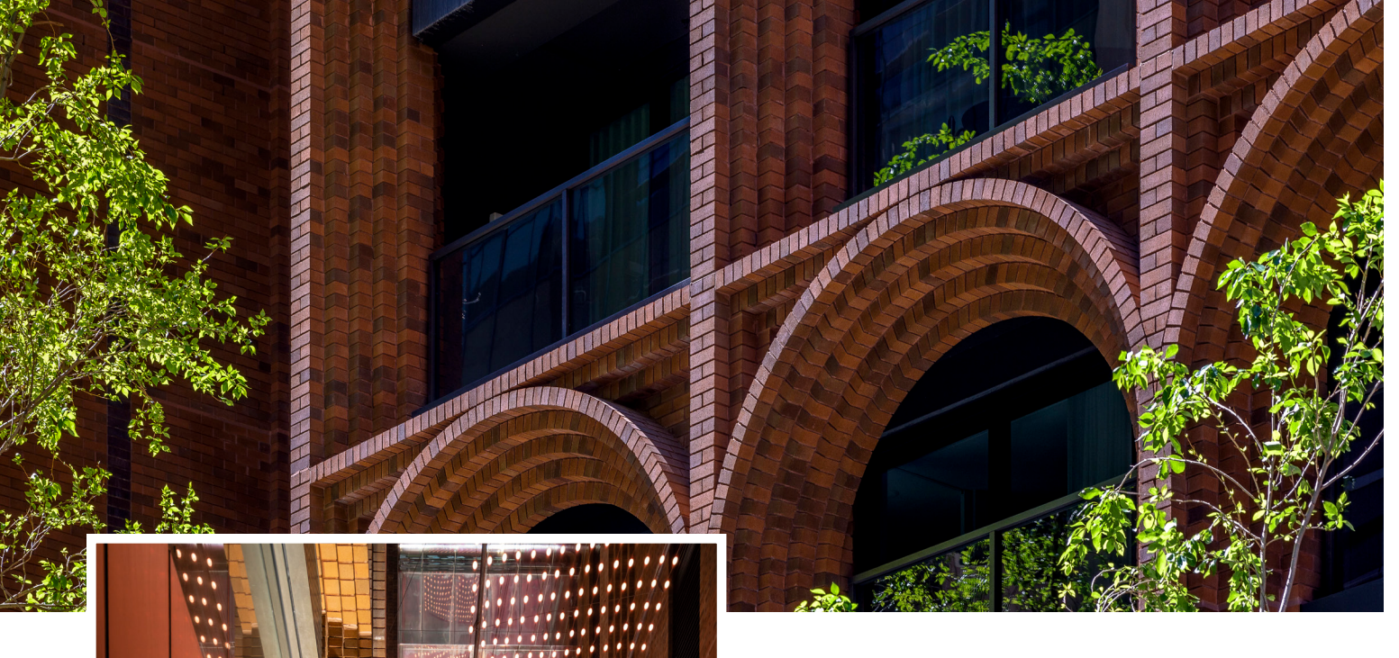
With the knowledgeable curved nature of Sydney Harbor and the masonry in the nearby structures, the materials and details have a level of sophistication and authenticity that relates to Sydney's past.

"Everything you see in Sydney is very feminine, very curvilinear. So beautiful. We should be connecting to that. It became a conscious decision to crown the building with an architectural feature that relates to how people perceive Sydney. We have taken a risk and hope others will read this as a message to take one too." Says Koichi Takada