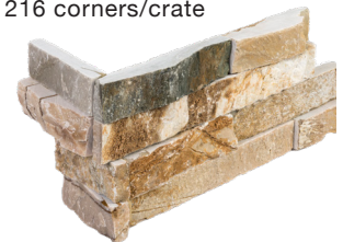
Honey Blend 5 lbs ea.

Classic corners: *6 corners/box; 216 corners/crate