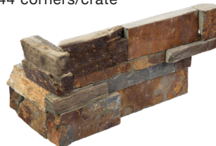
Autumn Blend 9 lbs ea.

Natural corners: *4 corners/box; 144 corners/crate