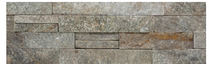
Mountain Side (Special Order)