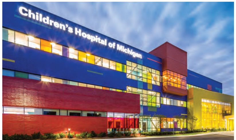
Seven Custom Glazed Brick (BIA AWARD WINNER)