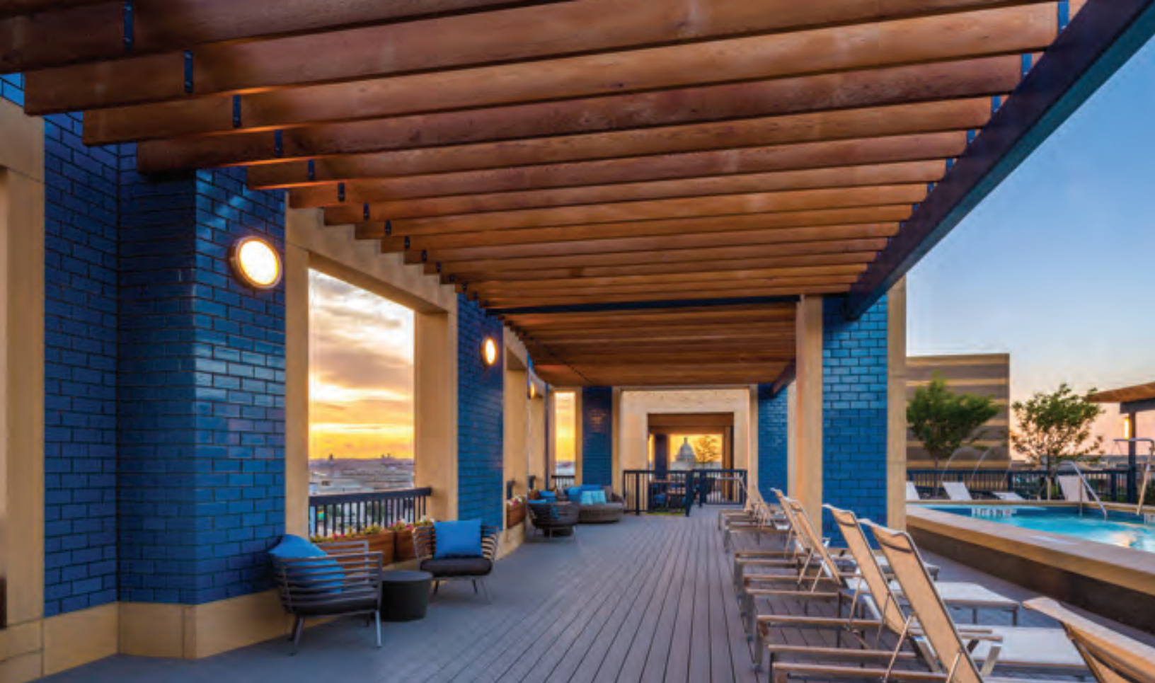
Bermuda Blue (G391) Econo