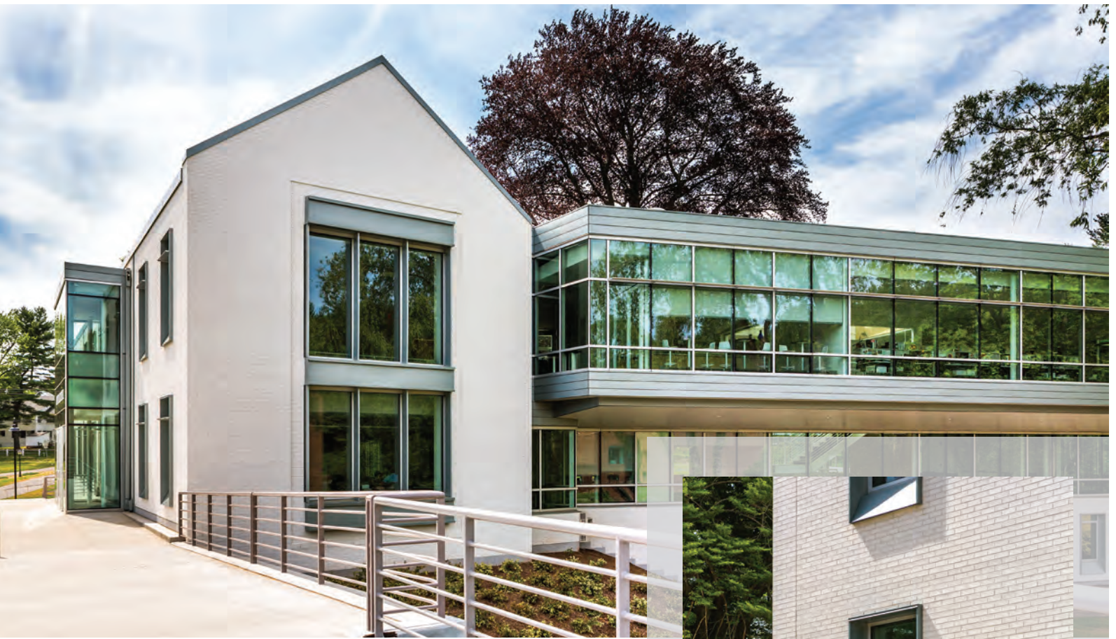
Aspen White (W804) (BIA AWARD WINNER)