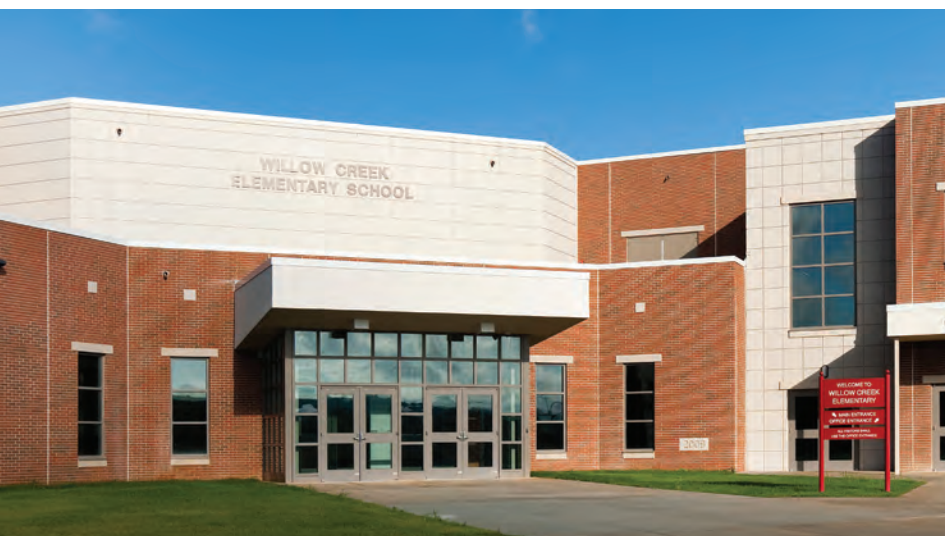
Sunset Flashed (FS15) Thin Brick (Precast application)