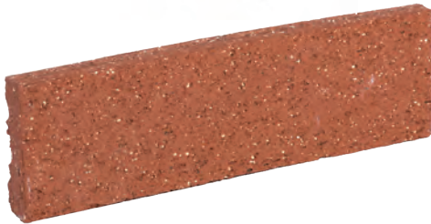
Eastline thin brick with dovetail back.

Hanley also has the ability to cut a broad range of full size brick down to a thin brick, including corners, to meet your job requirements. Both methods (extruded and cut) yield matching full and thin units for a seamless transition between wall structures, additions and more. Grinding/waxing is also available to meet PCI tolerances for precast/tilt up applications.