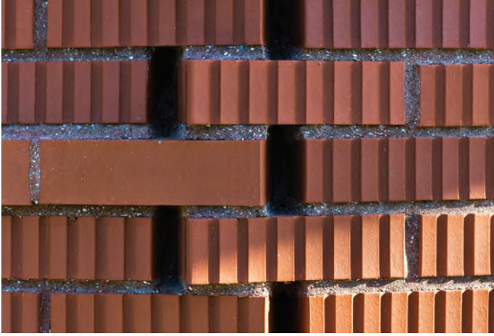
Sunset (S15) custom shape