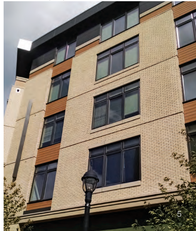
Cream White (S30) Thin Brick