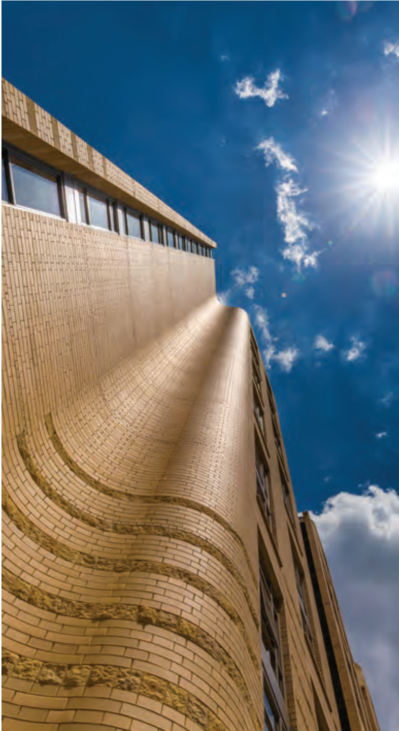
Golden Dawn (S27-28) Econo, Saxon and Titan