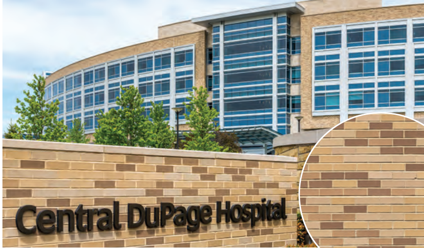
Four-way Custom Blend: (25%) Oyster Grey (S56), (25%) Smoky Quartz (S72), (25%) Toledo Grey (S75) and (25%) Dark Brown (S76)