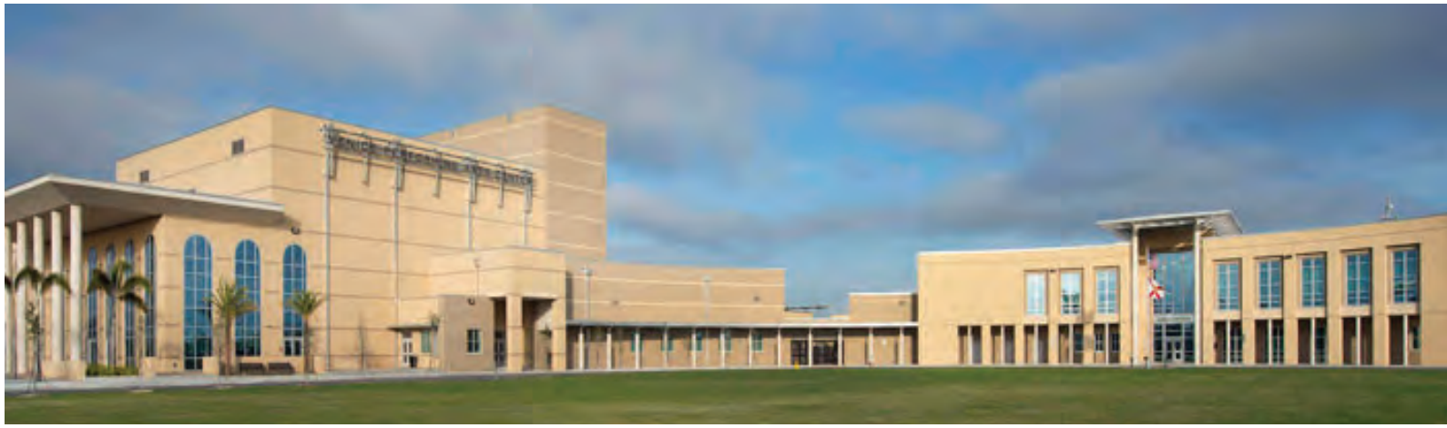
Sand (R33), Boulder Grey (R83) Full and Thin Brick