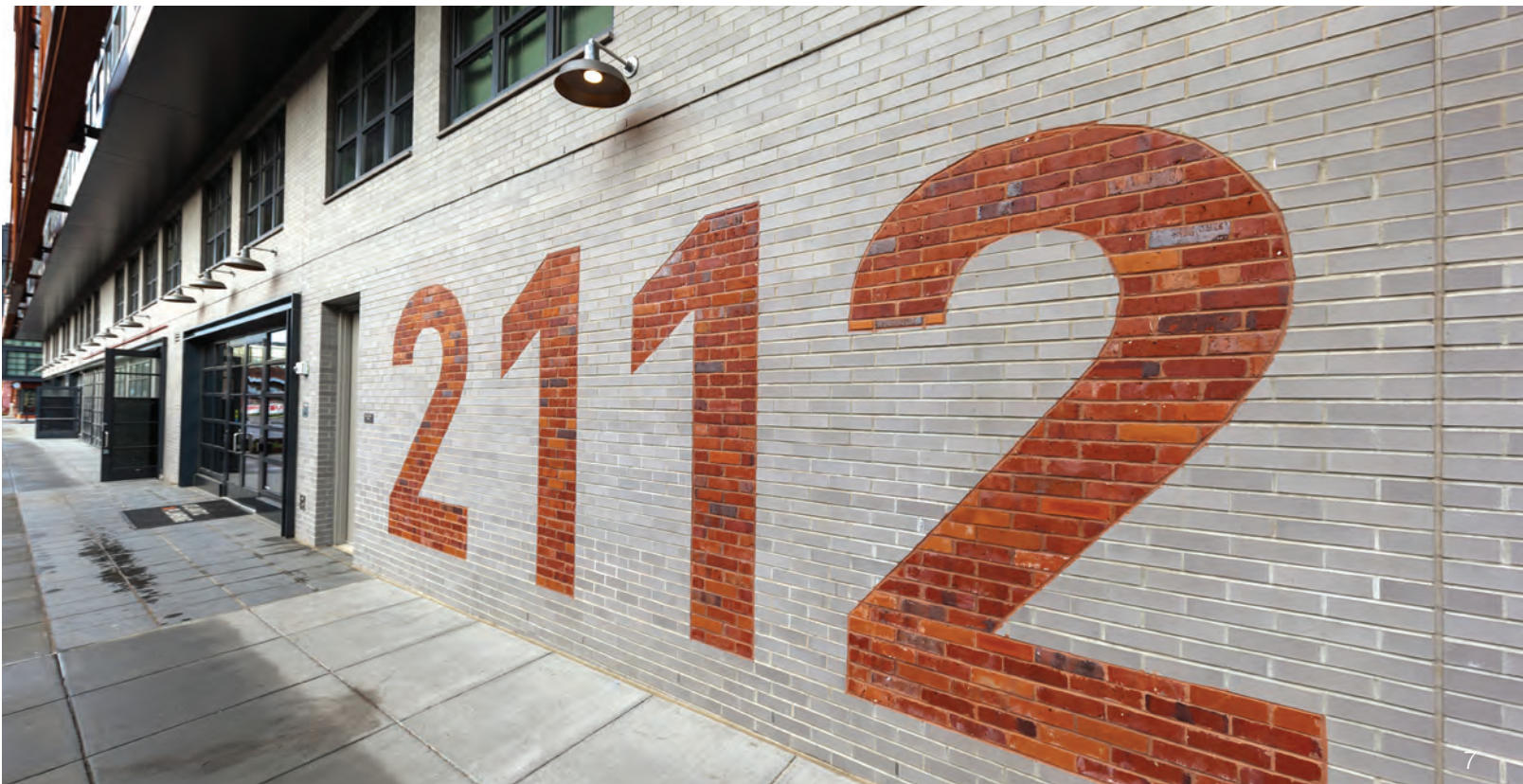
Stone Grey (K12-3009) (BIA AWARD WINNER)