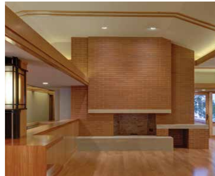
Red Colonial Norman Thin Brick*