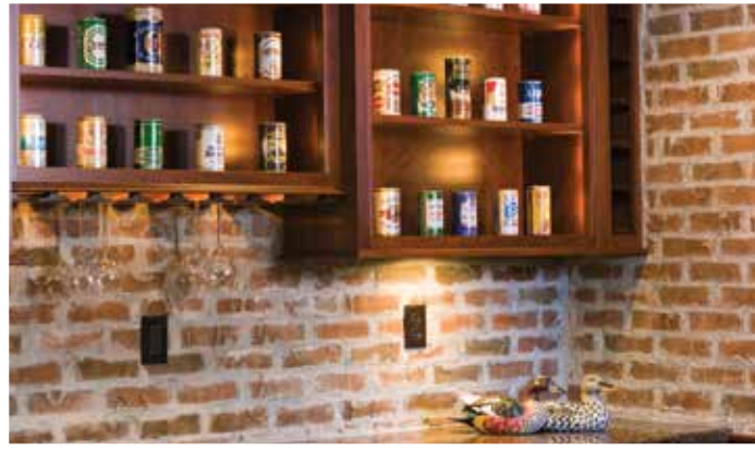
Stratford Thin Brick