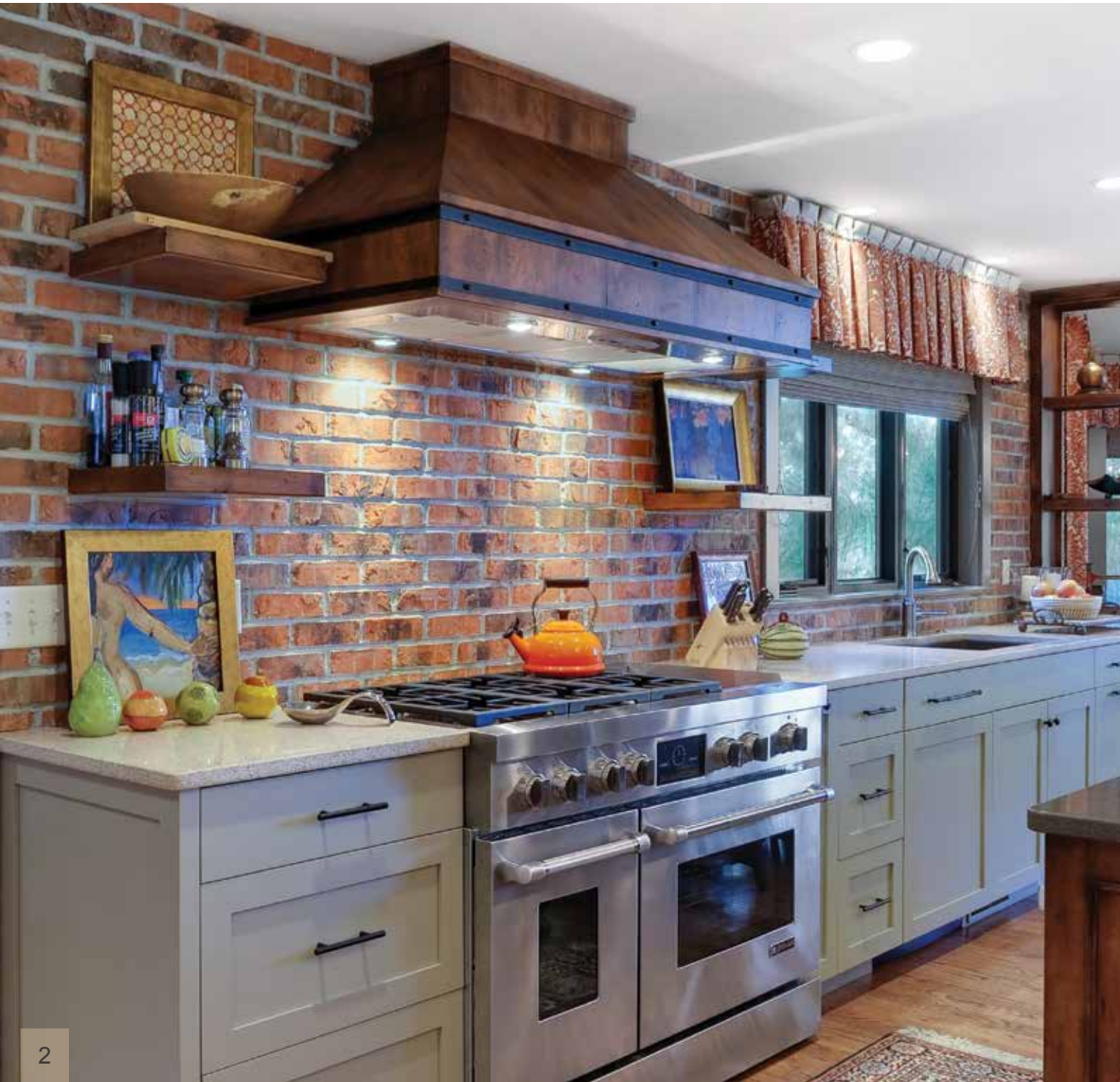
Milwaukee Thin Brick

Glen-Gery, America's Premier Brickmaker for over 125 years, innovates richly appealing product lines, with clay brick made exclusively in the United States. Our Thin Brick yields the same craft and commitment to quality that characterizes all of our products. When you choose Glen-Gery Thin Brick, you're choosing to transform your project with the rich appearance and lasting service that only brick can provide.