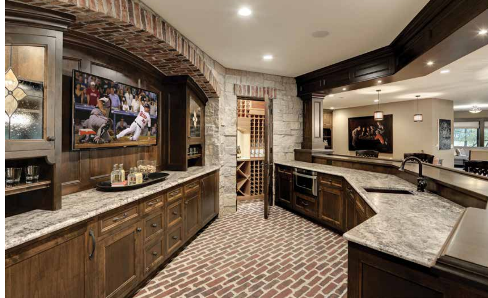
Brandywine HMOS Thin Brick

Not all Thin Brick are recommended for use in interior paving applications. Please consult a masonry professional to ensure proper design/installation.