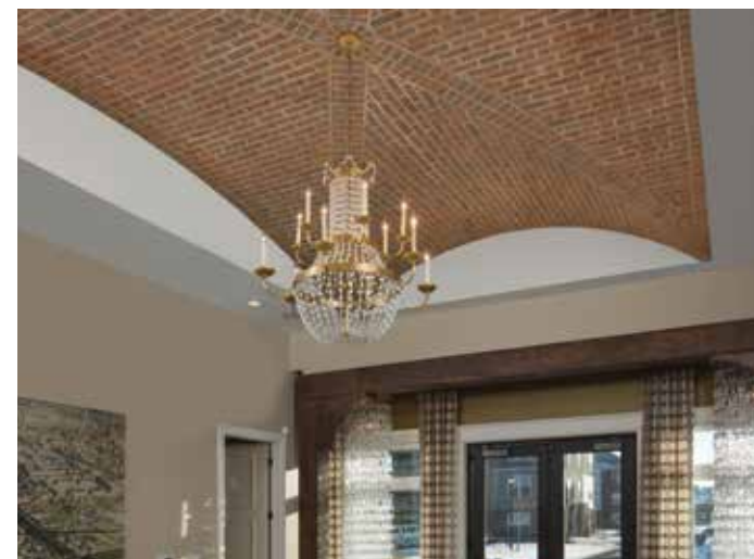
Stratford Thin Brick