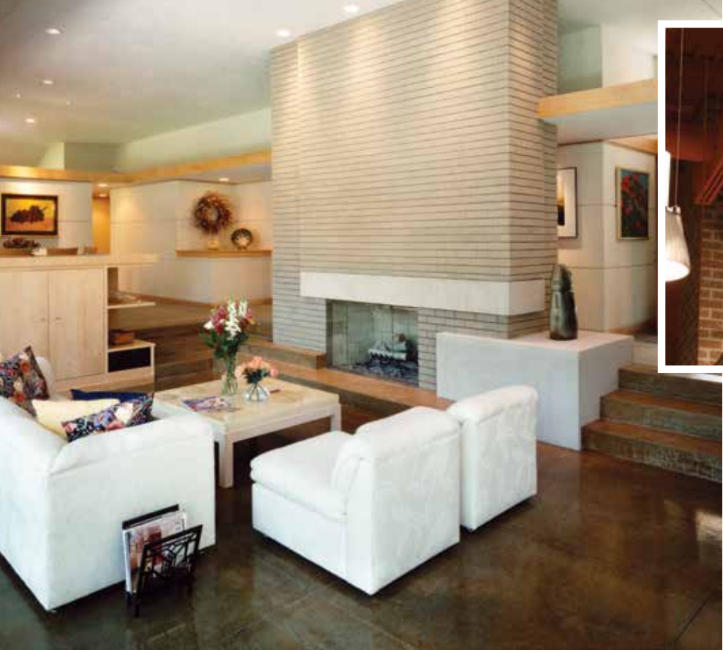
Oyster Grey (S56) Thin Brick*