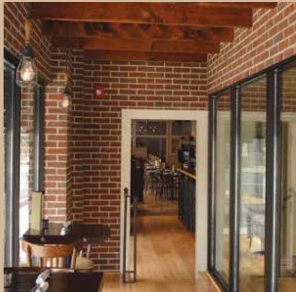
Aberdeen Thin Brick installed with Thin Tech®