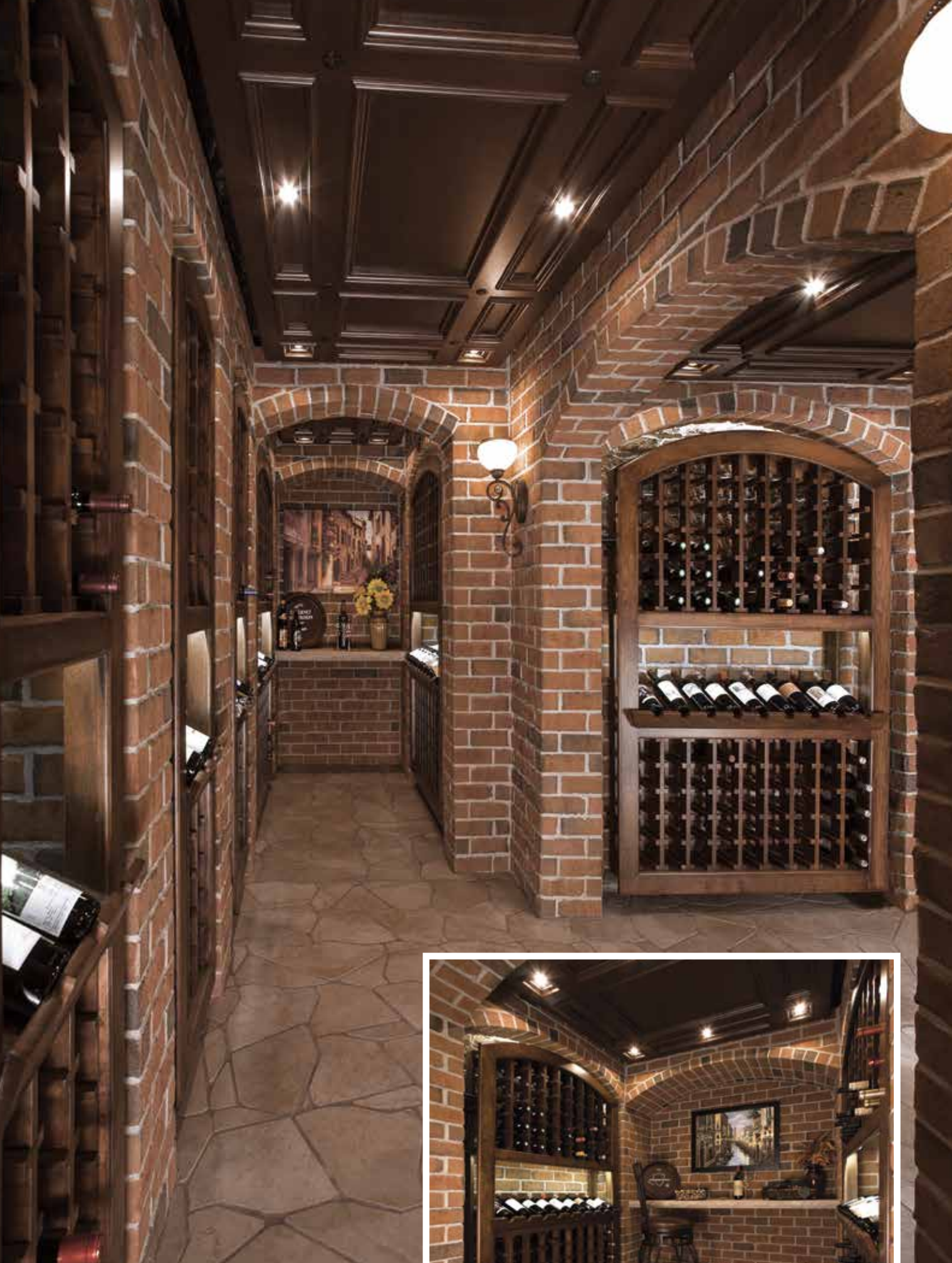
La Salle Thin Brick*