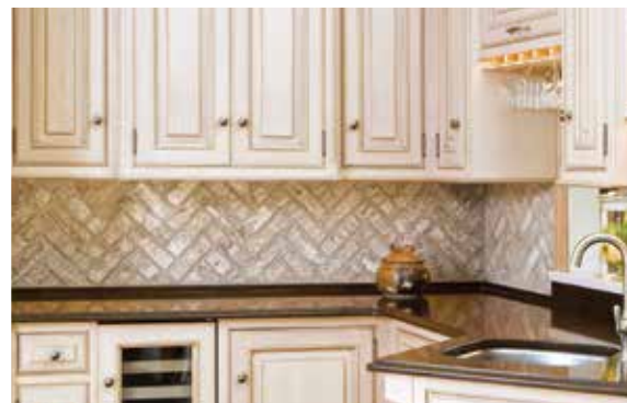
Bayhill Thin Brick