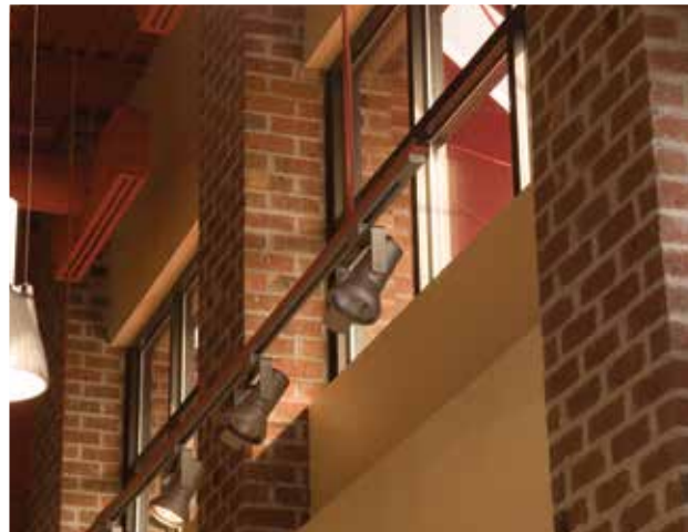
St. Windsor Thin Brick