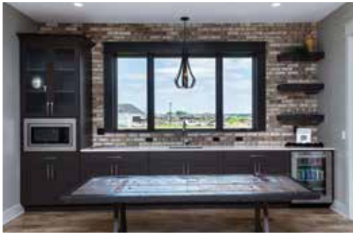
Silverbrook Thin Brick