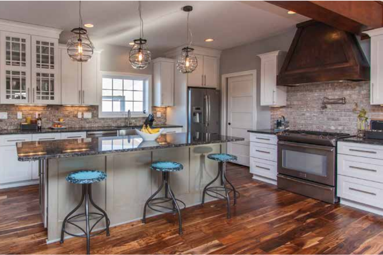
Nob Hill Thin Brick

This lightweight product requires less supporting structure, allowing for installation almost anywhere including ceilings and floors. Our all natural, sustainable products are available in a large color palate. Unique installation options complement any style making it a great addition to any interior design scheme from modern to rustic and more!