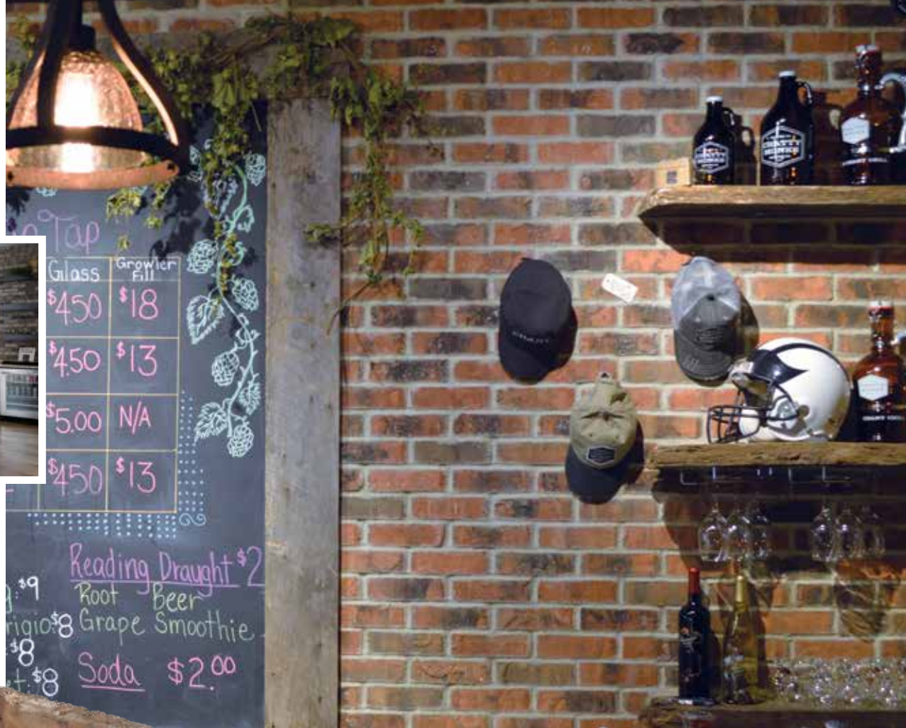
Milwaukee Thin Brick