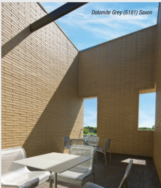
Dolomite Grey (S181) Saxon