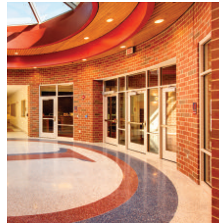
Ravenna Titan (with false mortar joint)