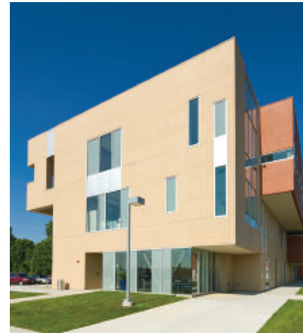
Dolomite Grey (S181) Saxon Red Cliff (S12) Saxon

Installations like these suggest the practically limitless building and design possibilities that can be achieved with Glen-Gery's larger size brick.