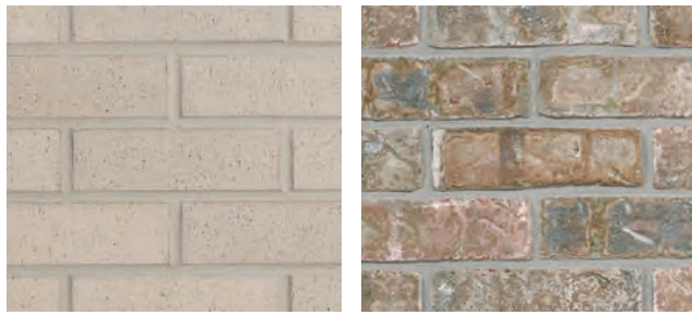
Revere Pewter Velour