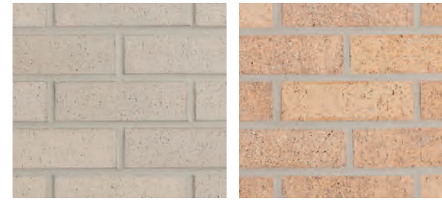
Revere Pewter Velour