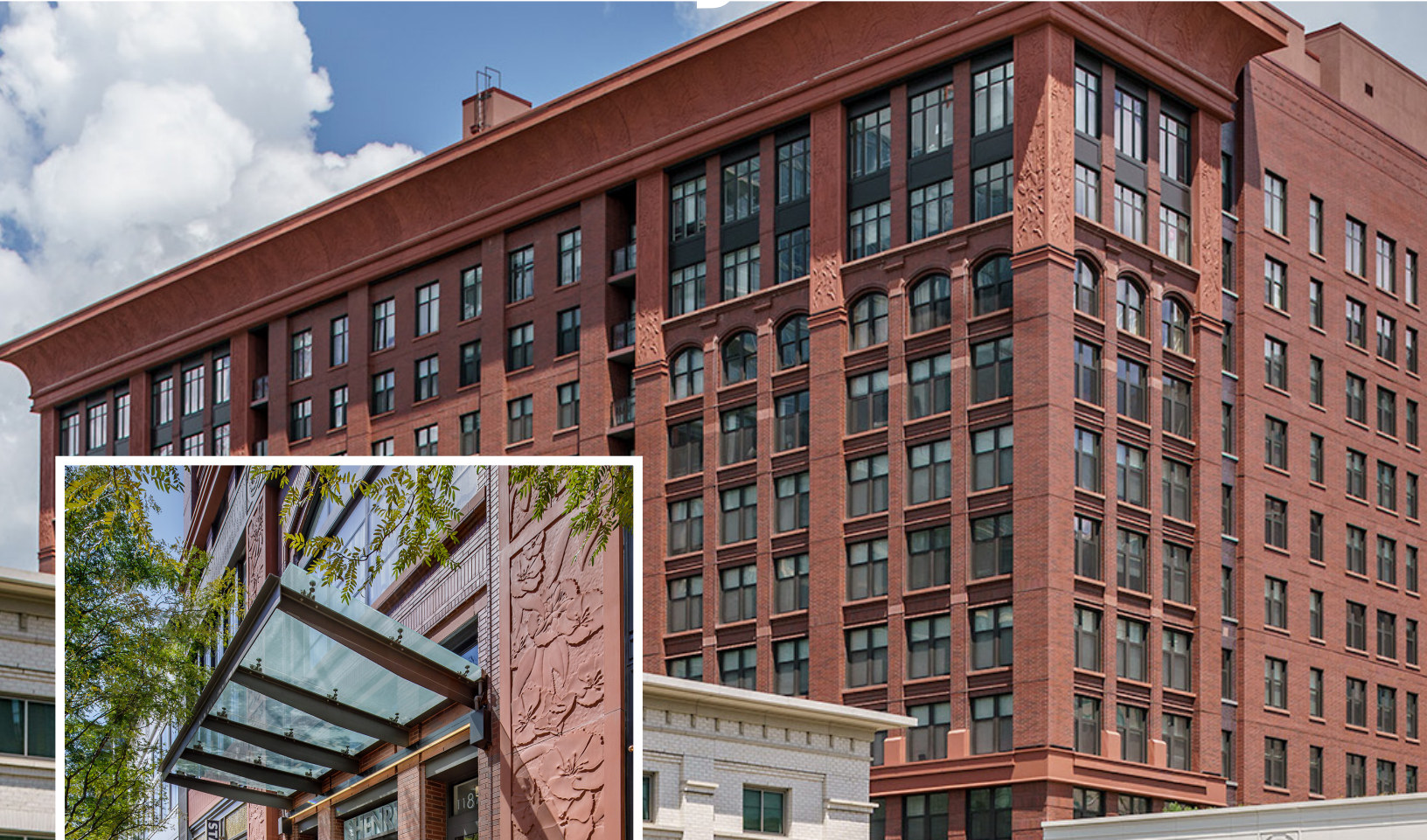
Napa Valley Brick